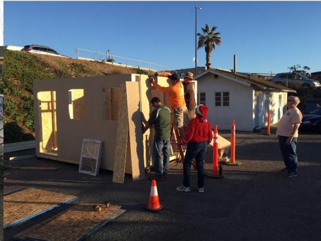
Rotary elves constructing Santa's House

Our Agency of Record, Mental Marketing, has secured great stories on this event including the story that broke today in the LA Times “Off Beat Christmas Holiday Lights and Events” article !!! This will also come out in the travel section on Sunday in print!