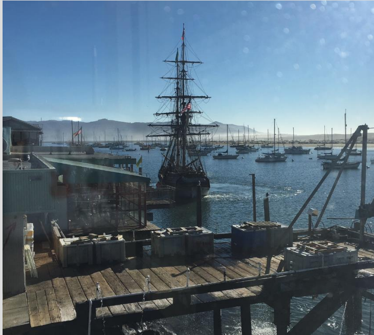
Tall ship Lady Washington in the Morro Bay Harbor