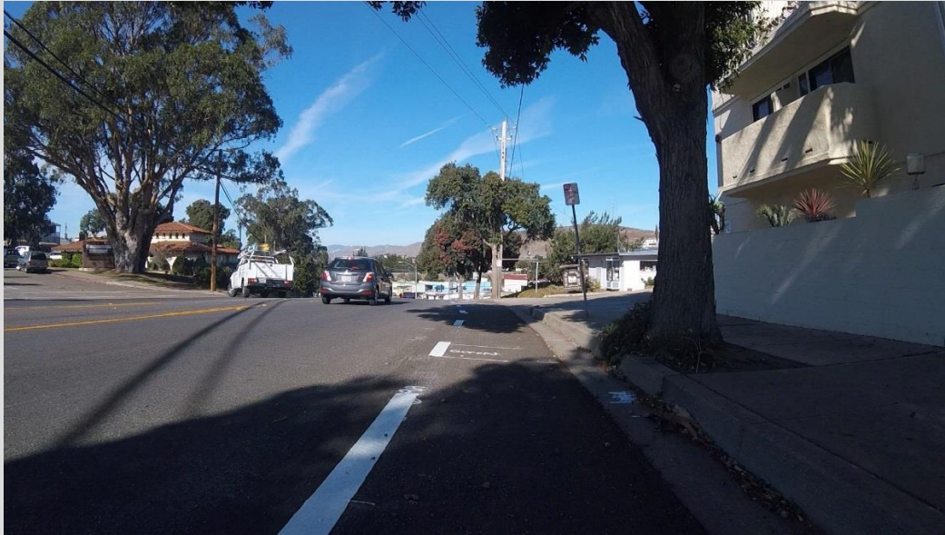
Recent Paving done on Main Street

In the next City Manager's Update, look for information from these departments as well as the Police Department, City Administration and Recreation Division.