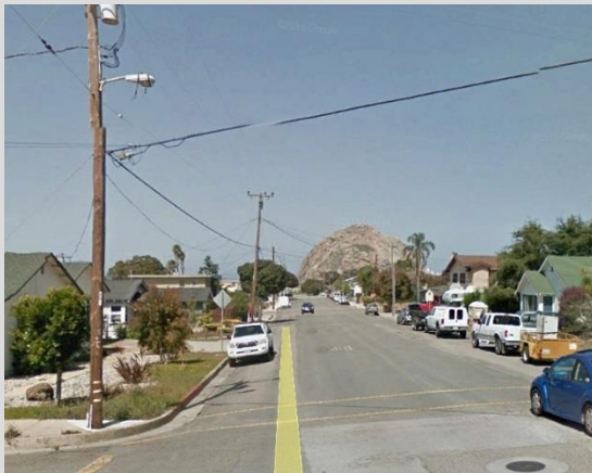
Before work conducted (Harbor and Napa)

Sidewalk Gap Closure: Scope of work is approximately 50-percent complete (see before and after photos). Construction work will continue on Main Street between Marina and Driftwood next week.