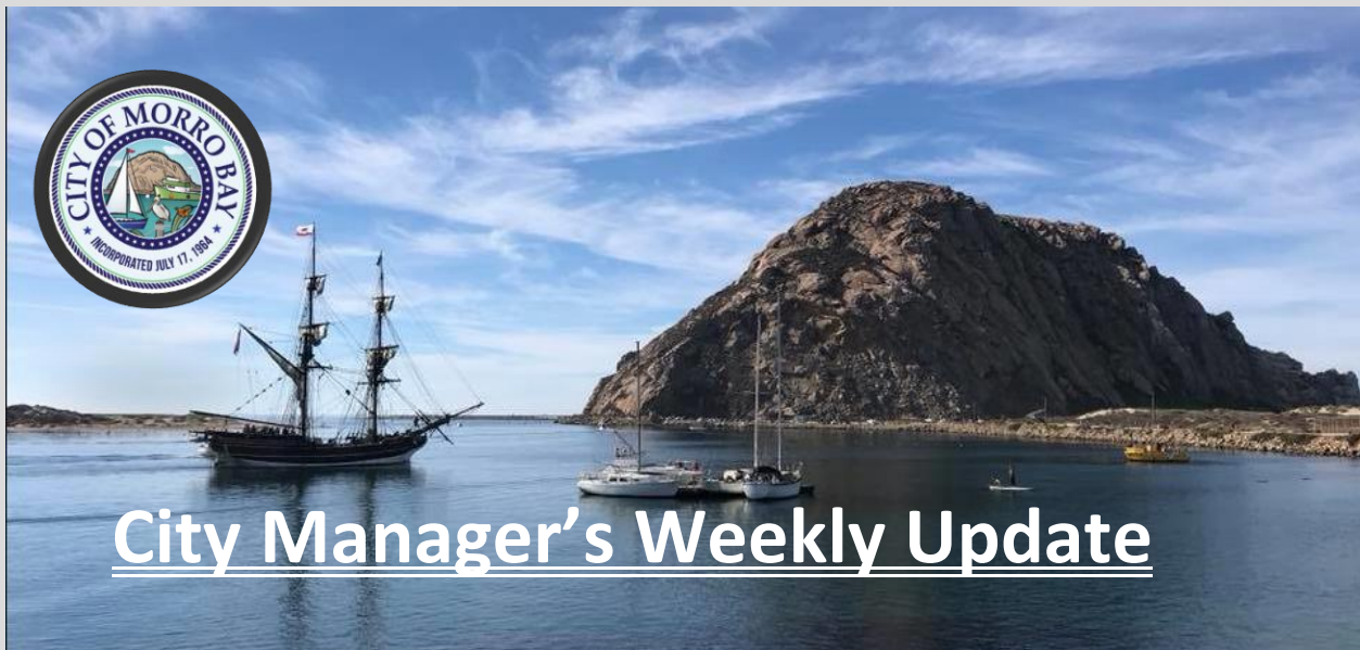
Photo: Another beautiful day in Morro Bay