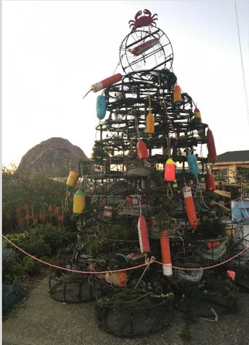
Crab pot Xmas Tree

The solid support from City staff to help complete a multitude of tasks this week has been fantastic! Harbor, Maintenance, Fire, Police, Rec and Tourism all working together for the greater purpose has been amazing!