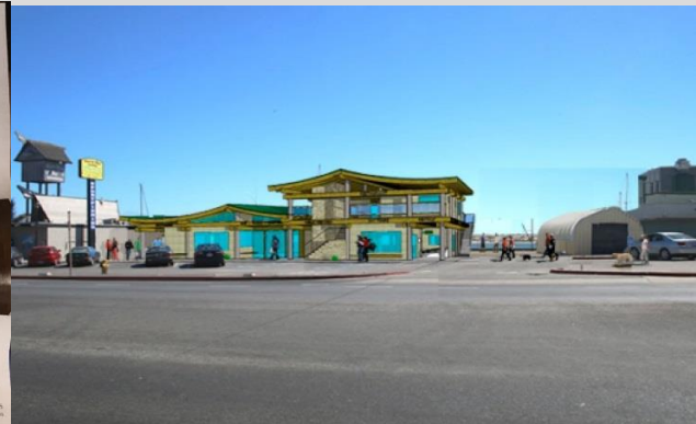
1215 Embarcadero project

General Plan Update: a. The Scoping meeting for the EIR was held on November 21 st and the Notice of Preparation has been routed to the State Clearing house with comments from Responsible and Trustee agencies due no later than December 8 th 2017. b. Initial administrative Draft of the General Plan/Local Coastal Program (GP/LCP) has been reviewed by Staff and returned to Michael Baker for edits. c. Staff completed review of the administrative draft of the Development Standards module for the Zoning Code update this week and returned comments to Michael Baker for revisions.