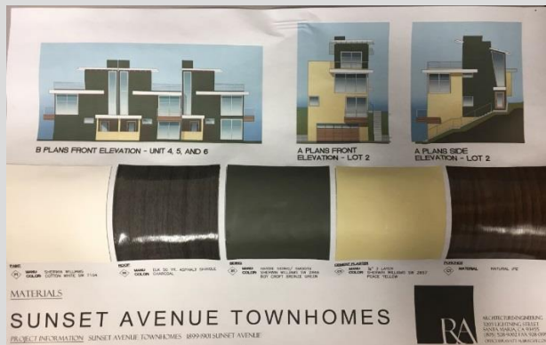
1899 Sunset Avenue